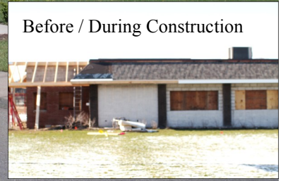
Before / During Construction